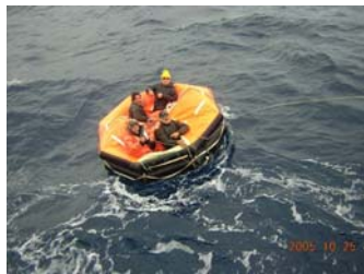
United States Coast Guard's Elev-

The Amver Vessel M/V Cape Nelson rescued four fishermen from their sinking boat 625 nautical miles off the coast of San Francisco, California on October 25, 2005. The skipper of the sailing vessel, along with three others, activated their EPIRB and made distress calls before abandoning ship into a life raft. The